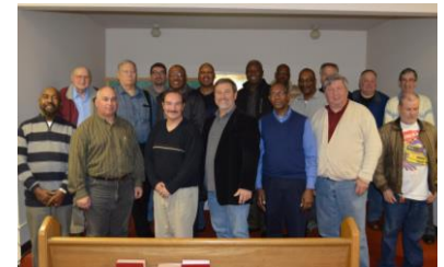
Men's Ministry Participants