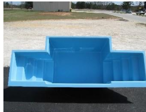
The baptistery we wanted to order.