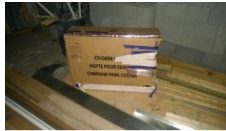
The baptistery with all equipment God provided