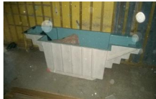
Out of the packaging