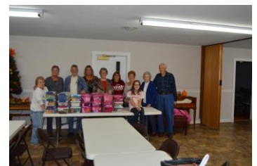
Above Two Photos: Dublin FCOG Shoe Boxes Completed, Bottom: Abingdon FCOG Team and boxes